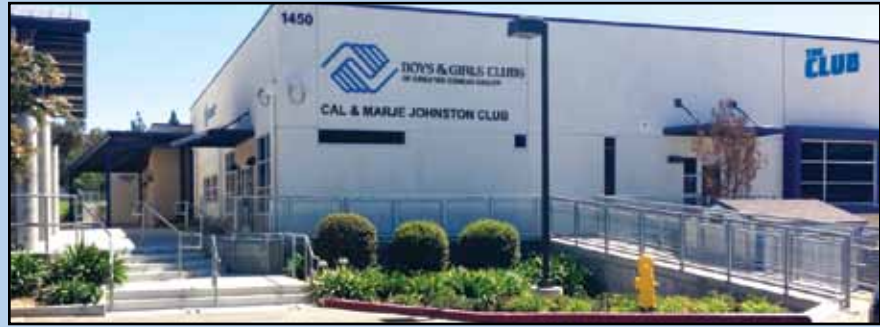
The Cal and Marje Johnston Boys & Girls Club located in Conejo Valley.