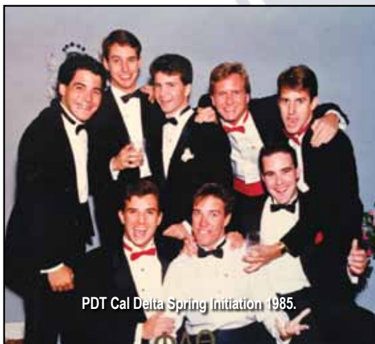
PDT Cal Delta Spring Initiation 1985.

I now head up North Highland's Sales and Service Effectiveness practice on a worldwide basis. With over 2,500 consultants across 50 countries, I have been fortunate to work with some great people and deliver unique value and big ideas for clients such as Nissan, ABC Television, Home Depot, McKesson, etc.