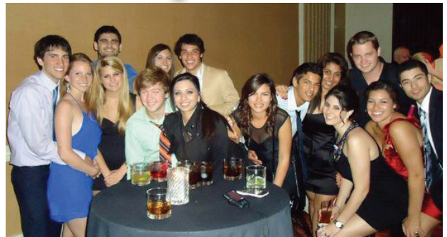
The Brothers & their dates at the annual Spring Formal in Las Vegas, Nevada 2011.