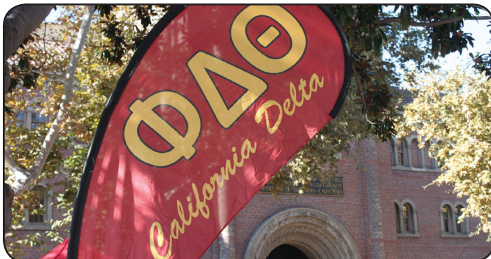
The Cal Delt Flag greets Tailgaters on Trousdale at all of our home games.