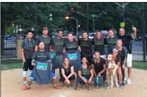
The Access One co-ed softball team 2017 champs.