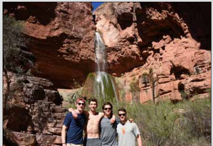
A spring break 2017 trip with pledge brothers to Ribbon Falls in the Grand Canyon.

Outside of school, I really enjoy exploring the areas off campus in Los Angeles and beyond. I have taken trips with friends to different beaches and state parks, the Sierras, and even the Grand Canyon last spring.