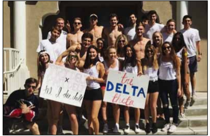
Fall chapter philanthropy.