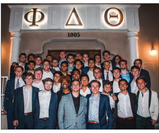
Cal Delta welcomes the new pledge class! Pictured above is the Alpha Gamma Class after their Initiation Ceremony.