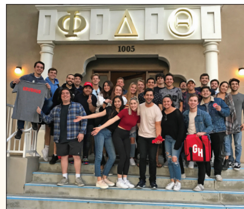
Actor Josh Peck (from Nickelodeon's Drake & Josh) poses on the Phi Delta steps after being the surprise celebrity for a GrubHub promotion.

Outside of school, I am a writer and performer for The Suspenders, USC's oldest sketch comedy troupe. I work on their digital marketing. It is an awesome opportunity to work with some of the funniest people on campus, and this allows me to channel my idiocy within Phi Delt into a creative platform. I also love watching movies with my brothers at Phi Delt. Over the past few months, I have organized several trips to the TCL Chinese Theater with 10-12 Phi Delt members and friends to see blockbusters opening weekend.