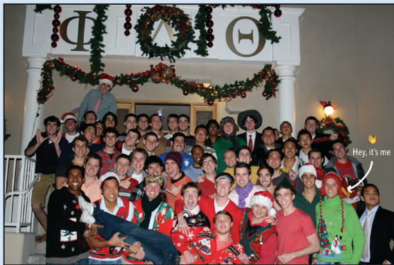
Holiday party from back in my undergraduate days at Phi Delta Theta (my freshman year of college, 2010)