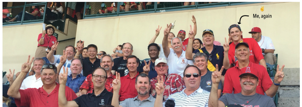
Above: Angels baseball game with alumni (2017) Below: USC football game with my wife (2019)